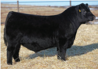
BROOKING FIREBRAND Sire