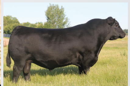
S A V SUPERCHARGER 6813 | Sire