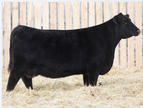
HLC ERICA 561G | Dam