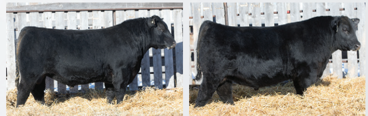
HLC LEADING EDGE 578G | Maternal Brother