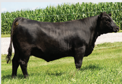
KEMP BROTHERS MAYFLOWER 16H | Dam