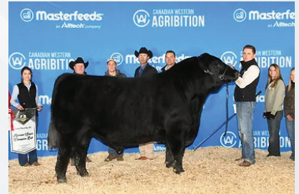
CHESTNUT TURNING HEADS 29 | Sire