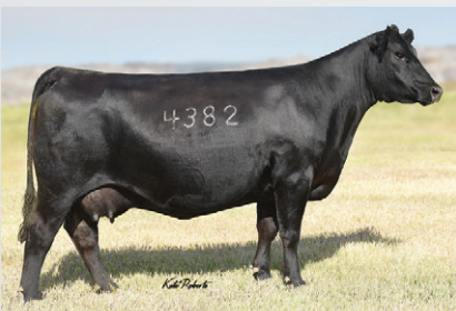
KR LADY MAY 4382 | Dam