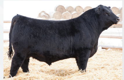
HLC HEAVY METAL 943E | Maternal Brother