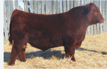
RED COCKBURN ROUND UP 8069 | Sire