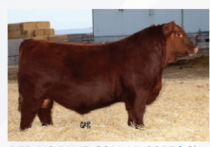
RED U2 BLUE COLLAR 295E | Sire