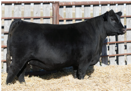
HLC CSI BLACKBIRD 697H | Dam