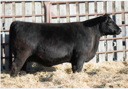
HLC CSI HEROINE 766H | Maternal Sister