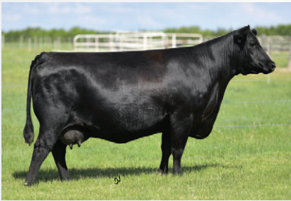
MUSGRAVE BLACKCAP 834-510 | Dam