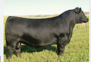
S A V EMBLEM 8074