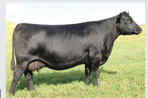
S A V MADAME PRIDE 8588