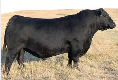
S A V BLOODLINE 9578 | Sire