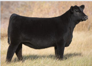
HLC PONDEROSA BLACKBIRD 70K Full Sister