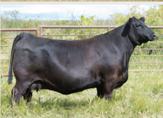
PONDEROSA 1749 BLACKBIRD 136A Dam