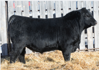
HLC UNANIMOUS 710H Maternal Brother