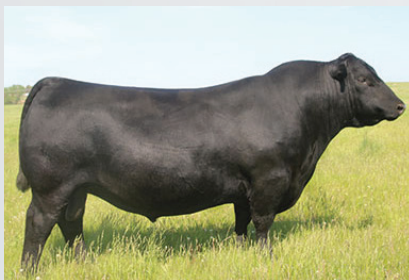
S A V RAINFALL 6846 | Sire