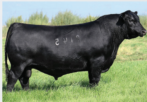
COLEMAN TRIUMPH 9145 | Sire