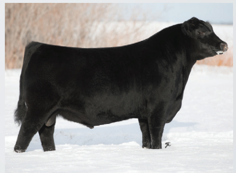
HLC PRIVATE STOCK | Maternal Brother