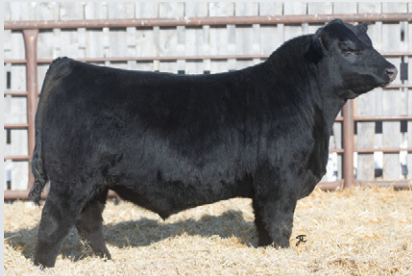
HLC OUTSIDER 854J | Maternal Brother