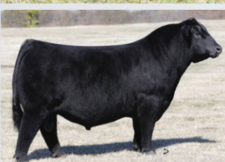
CONLEY EXPRESS 7211 Sire