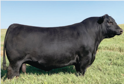
S A V AMERICA 8018 | Sire