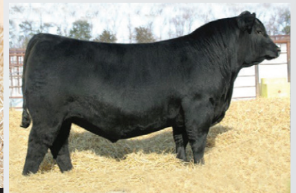
S A V WASHINGTON 9598 | Sire