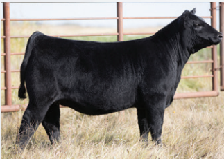
HLC ERROLINE 447G Maternal Sister