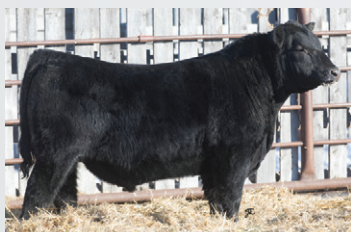
HLC RENEWAL 895J | Full Brother