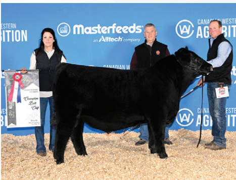
LOT 1 | CWA Intermediate Calf Champion