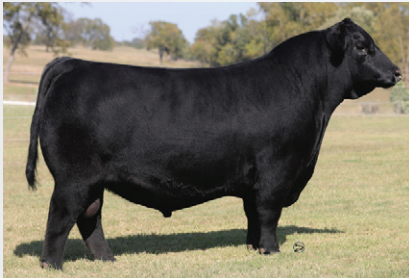
CONLEY SOUTH POINT 8362 | Sire