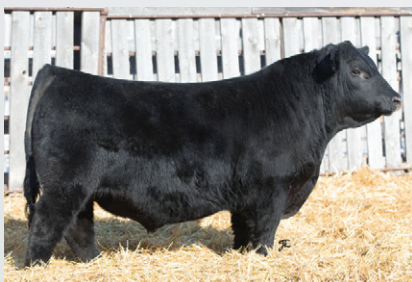
HLC HEAVY METAL 643H | Maternal Brother